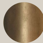
Ombré Aged Brass