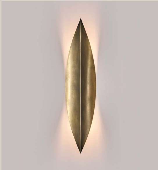
Ombré Aged Brass