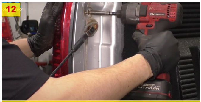
Put the new light on the truck and reinstall two bolts in.