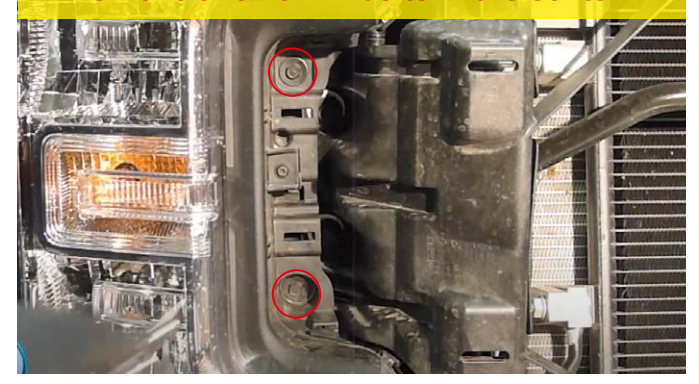
8. Remove one 10mm bolt on the top.