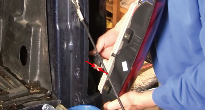
8. Connect the main connector.