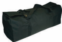
Waterproof Pole Bag