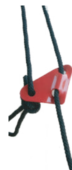
Metal Tension Adjusters