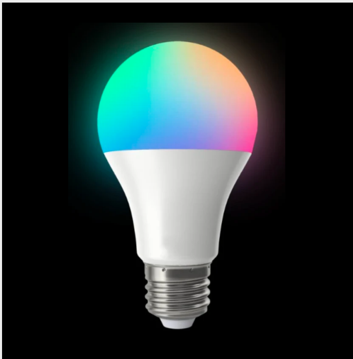
Pictured with the lights on

Powerful and futuristic Smart bulb that can sense and interact automatically with user control is an ultra-modern home's enhancement. The futuristic design and model is eye strikingly impressive. The spectacular features of this smart bulb is versatile and adaptable. This stunning bulb is something your modernistic home needs.