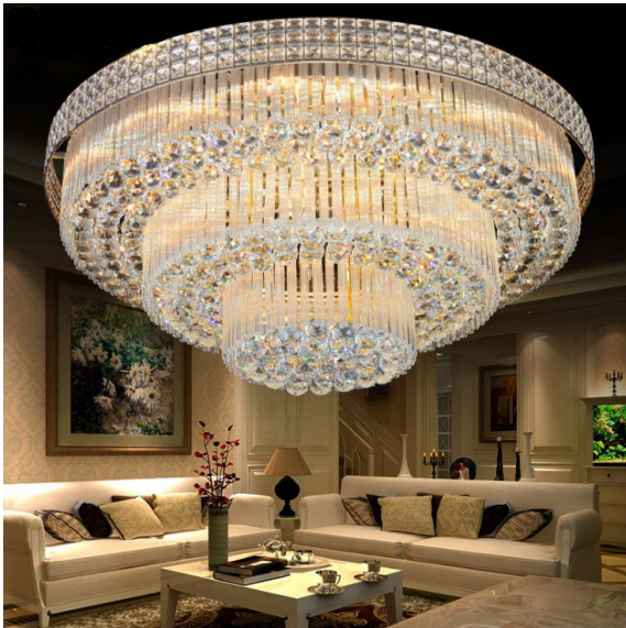
Pictured with the lights on