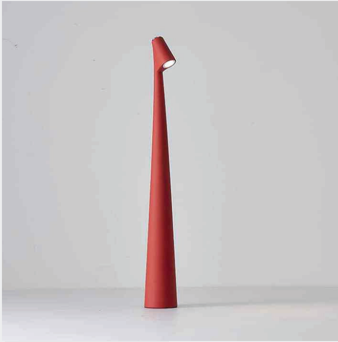
Pictured with the lights on