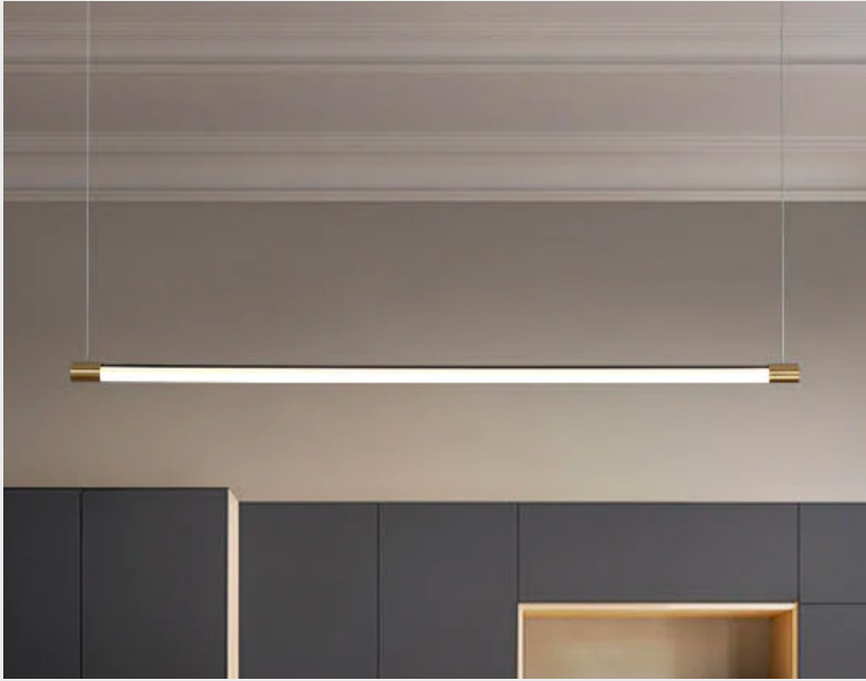
Pictured with the lights on

The Leger Minimalist Pendant is a modern lighting fixture with clean lines and a simple design, perfect for both home and business spaces. It provides gentle, concentrated light and blends form and function, making it a great choice for those seeking contemporary lighting solutions. Made from high-quality materials.