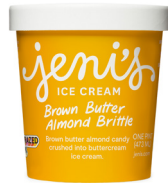
Brown Butter Almond Brittle