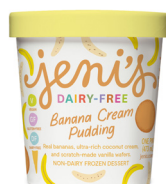
Banana Cream Pudding