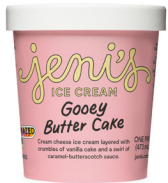
Goopy Butter Cake