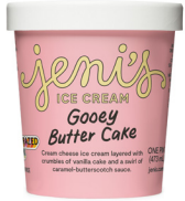
Goopy Butter Cake