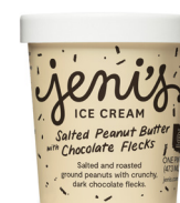
Salted Peanut Butter with Chocolate Flecks