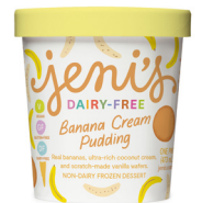
Banana Cream Pudding