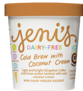
Cold Brew with Coconut Cream