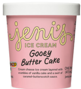
Goopy Butter Cake