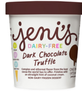
Dark Chocolate Truffle