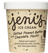
Salted Peanut Butter with Chocolate Flecks