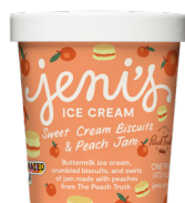
Sweet Cream Biscuits & Peach Jam