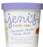
Caramel Pecan Sticky Buns