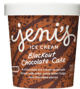
Blackout Chocolate Cake