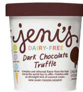
Dark Chocolate Truffle