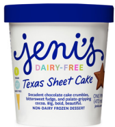
Texas Sheet Cake