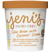
Cold Brew with Coconut Cream