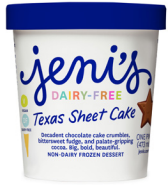
Texas Sheet Cake