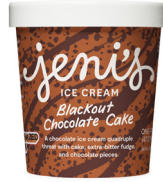
Blackout Chocolate Cake