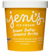
Brown Butter Almond Brittle