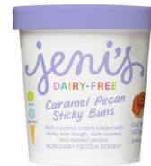
Caramel Pecan Sticky Buns