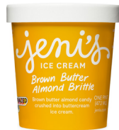
Brown Butter Almond Brittle