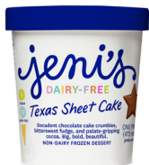
Texas Sheet Cake