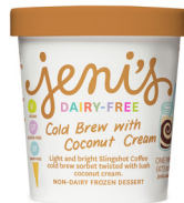
Cold Brew with Coconut Cream