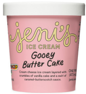
Goopy Butter Cake