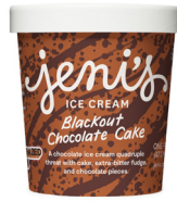
Blackout Chocolate Cake