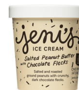
Salted Peanut Butter with Chocolate Flecks