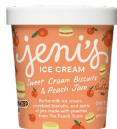
Sweet Cream Biscuits & Peach Jam