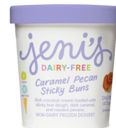
Caramel Pecan Sticky Buns