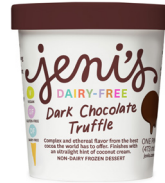
Dark Chocolate Truffle