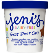
Texas Sheet Cake