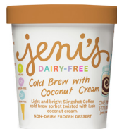
Cold Brew with Coconut Cream