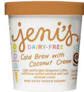
Cold Brew with Coconut Cream