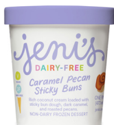
Caramel Pecan Sticky Buns