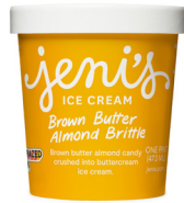
Brown Butter Almond Brittle