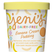
Banana Cream Pudding