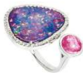
Bushfire Duette ring Flame opal, pink tourmaline with diamonds US$12,500