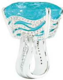
THE WAVE RING PARAIBA TOURMALINE 46.91ct