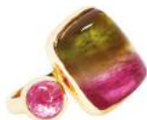
Duette ring Cabochon watermelon and pink tourmaline US$8,900