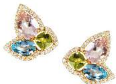
Aquamarine, peridot, morganite and diamond earrings US$8,500