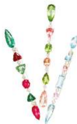
Javelin brooch collection From US$6,800