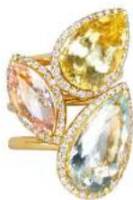
Aquamarine, morganite and yellow beryl diamond stacking rings From US$6,000