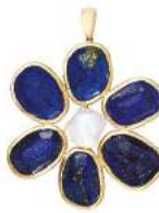
Flower pendant Lapis lazuli and baroque pearl. Reversible US$10,500