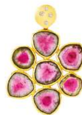
Seven Blushes Watermelon tourmaline and diamond pendant US$15,500