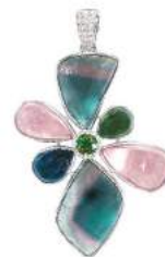
Orchid pendant Indicolite and pink tourmaline with diamonds US$10,250