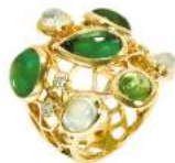
Cobweb ring Cabochon green tourmaline, rainbow moonstone with diamonds US$6,900