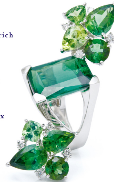
Rich forest green tourmalines

October's birthstone and the eighth wedding anniversary gemstone, this is the powerful gem of love and friendship , and as each gem is unique, tourmalines are the perfect expression of individuality.