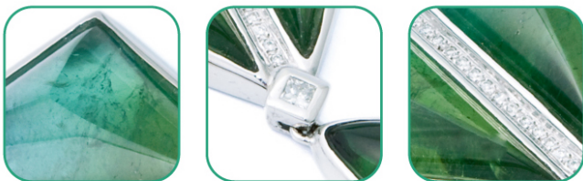
Spectacular carved bi-colour tourmaline and diamond Kite pendant