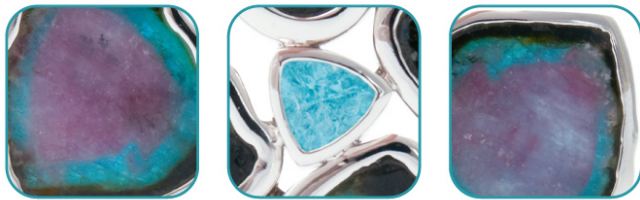
Rare and exotic Paraiba slice Clover pendant surrounding a Paraiba trillion centre