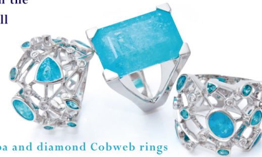
Paraiba and diamond Cobweb rings with the 27ct Paraiba Mahjong ring