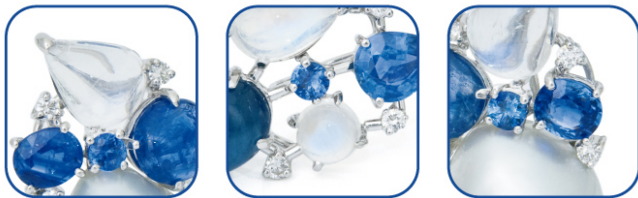
Gorgeous silver baroque South Sea pearls with Cobweb crescent pendant of sapphires, blue moonstones and diamonds