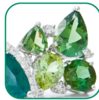
Inspiring and alluring Indicolite, green tourmalines and diamonds