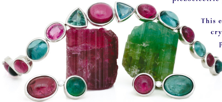
An arc of rubellites and indicolites