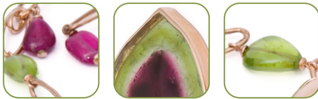
Luscious Watermelon and purple tourmaline pendant with a rubellite and peridot rose gold chain