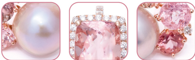
Adorable Morganite and diamond ring with sugar pink tourmaline and pearl earrings