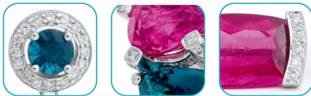
Elegant and stylish Rubellite, Indicolite and diamond collection