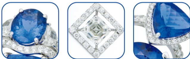
Exquisite and collectible Tanzanite rings with Asscher and trillion cut diamond earrings