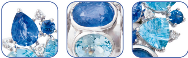
Wonderful and wearable cornflower blue sapphires and aquamarines