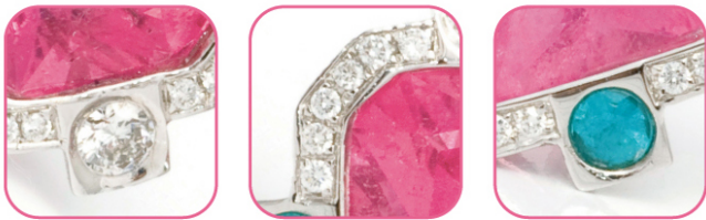
Dramatic and irresistible Rubellite, Paraiba and diamond earrings