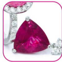
Fabulous hot pink Rubellites, diamonds and pearls