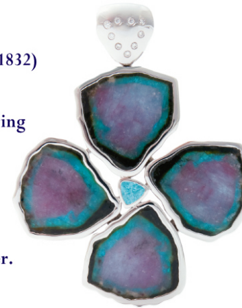
Rare Paraiba watermelon Clover pendant

Each Tayma design is handmade, and there is only one.