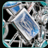
Stunning cabochon and cut Paraiba tourmalines, blue moonstones and diamond flexible Cobweb cuff