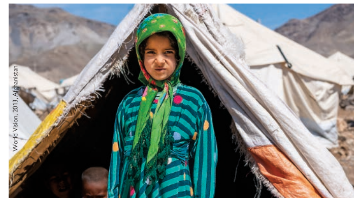
World Vision, 2013, Afghanistan