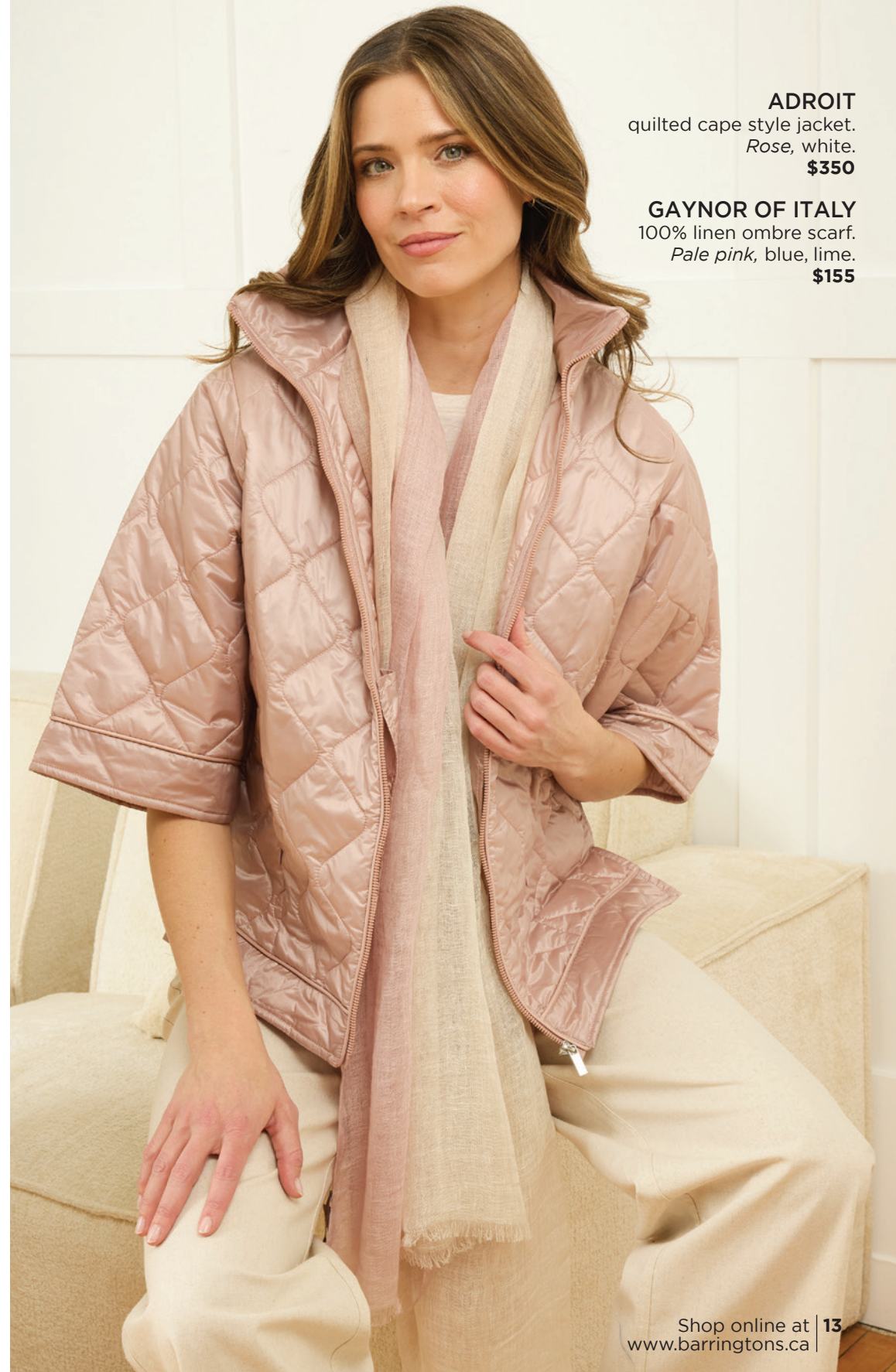
ADROIT quilted cape style jacket. Rose, white. $350