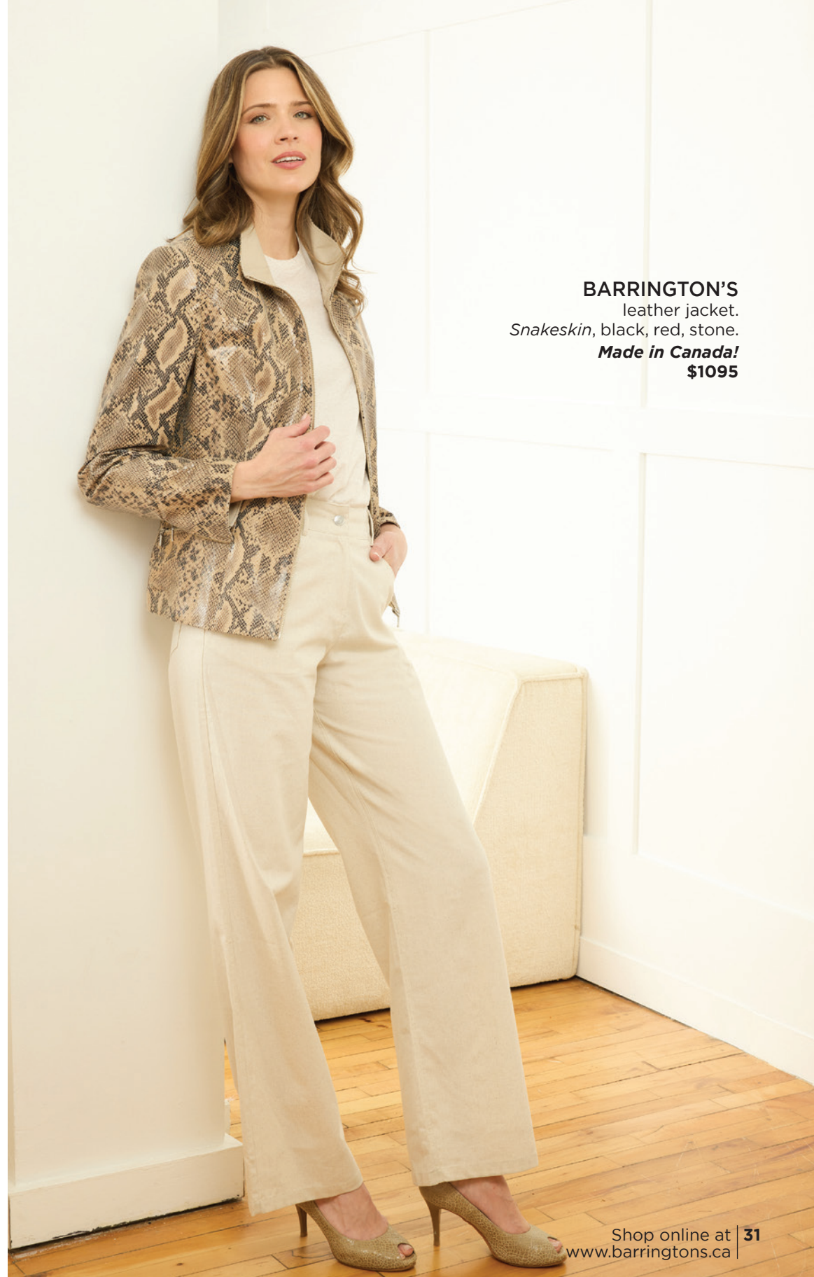
BARRINGTON'S leather jacket. Snakeskin, black, red, stone. Made in Canada! $1095