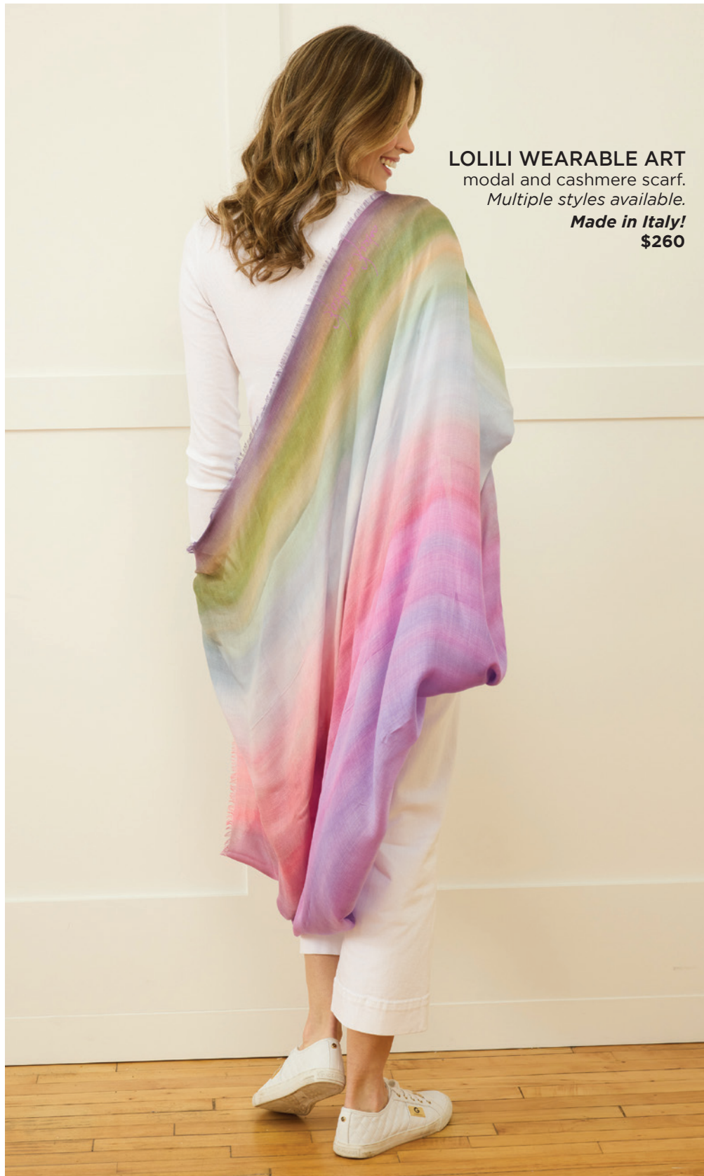
LOLILI WEARABLE ART modal and cashmere scarf. Multiple styles available. Made in Italy! $260