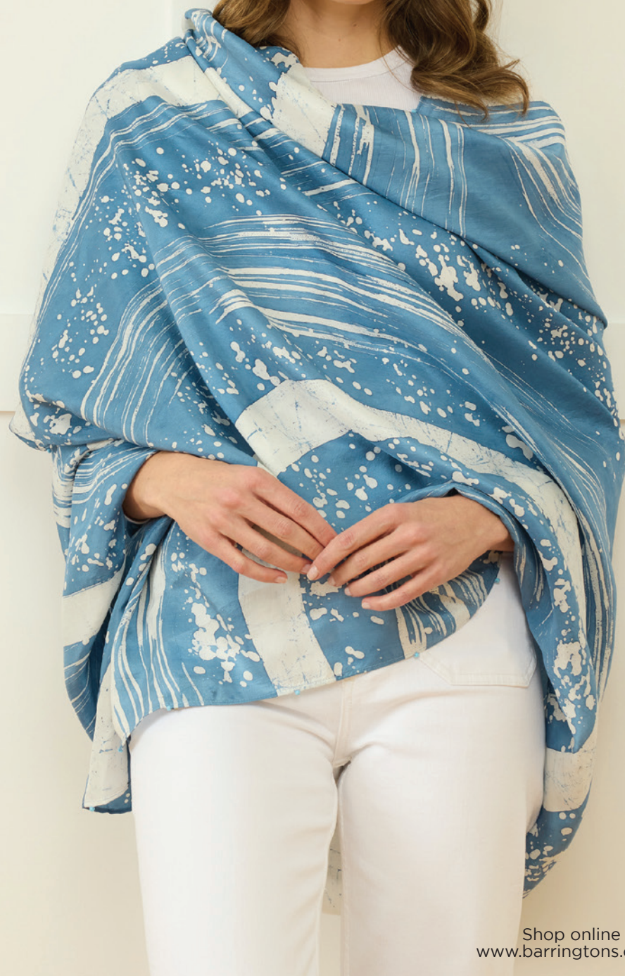
AMET & LADUE 100% silk scarf. Blue/white, white/black. $225