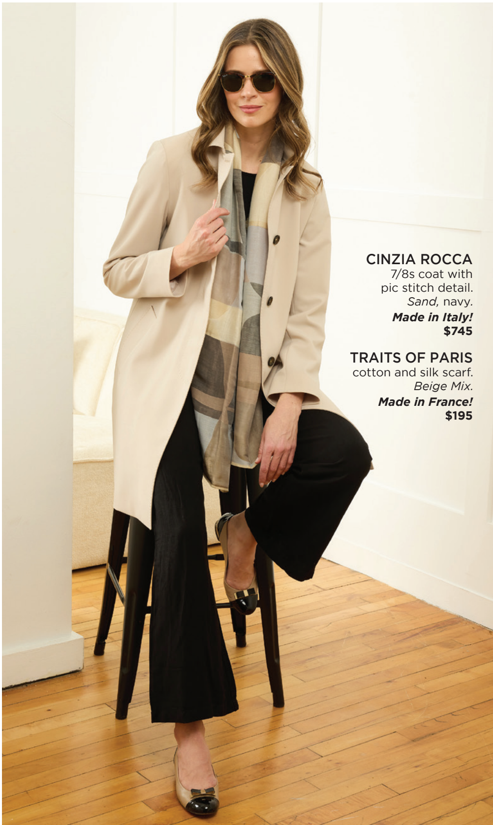
CINZIA ROCCA 7/8s coat with pic stitch detail. Sand, navy. Made in Italy! $745