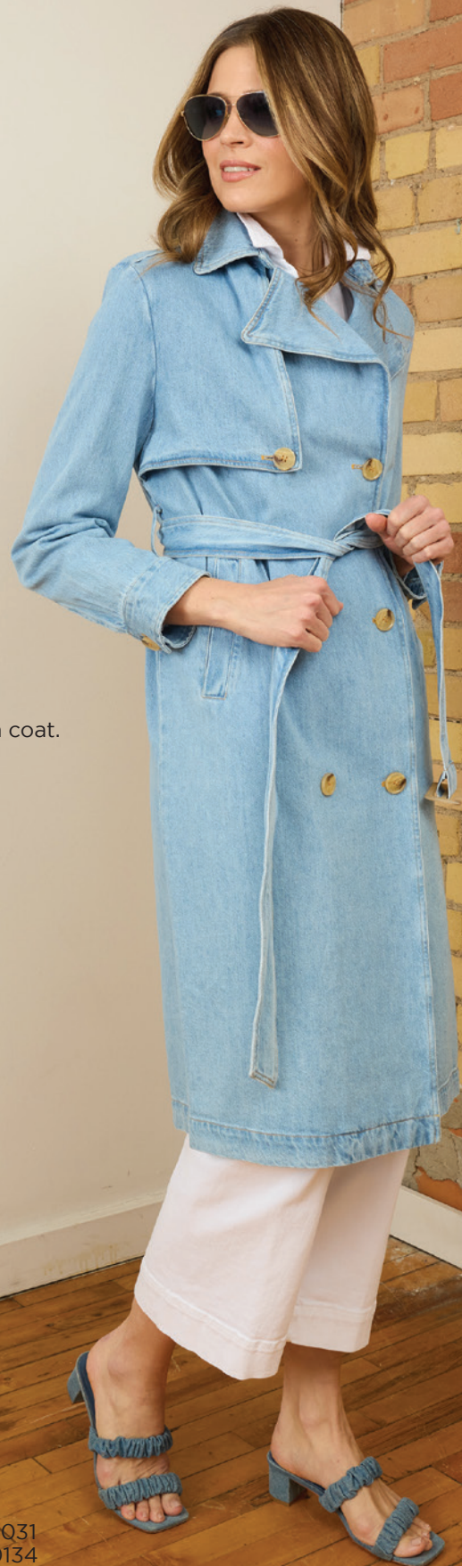
ADROIT denim trench coat. Denim only. $450