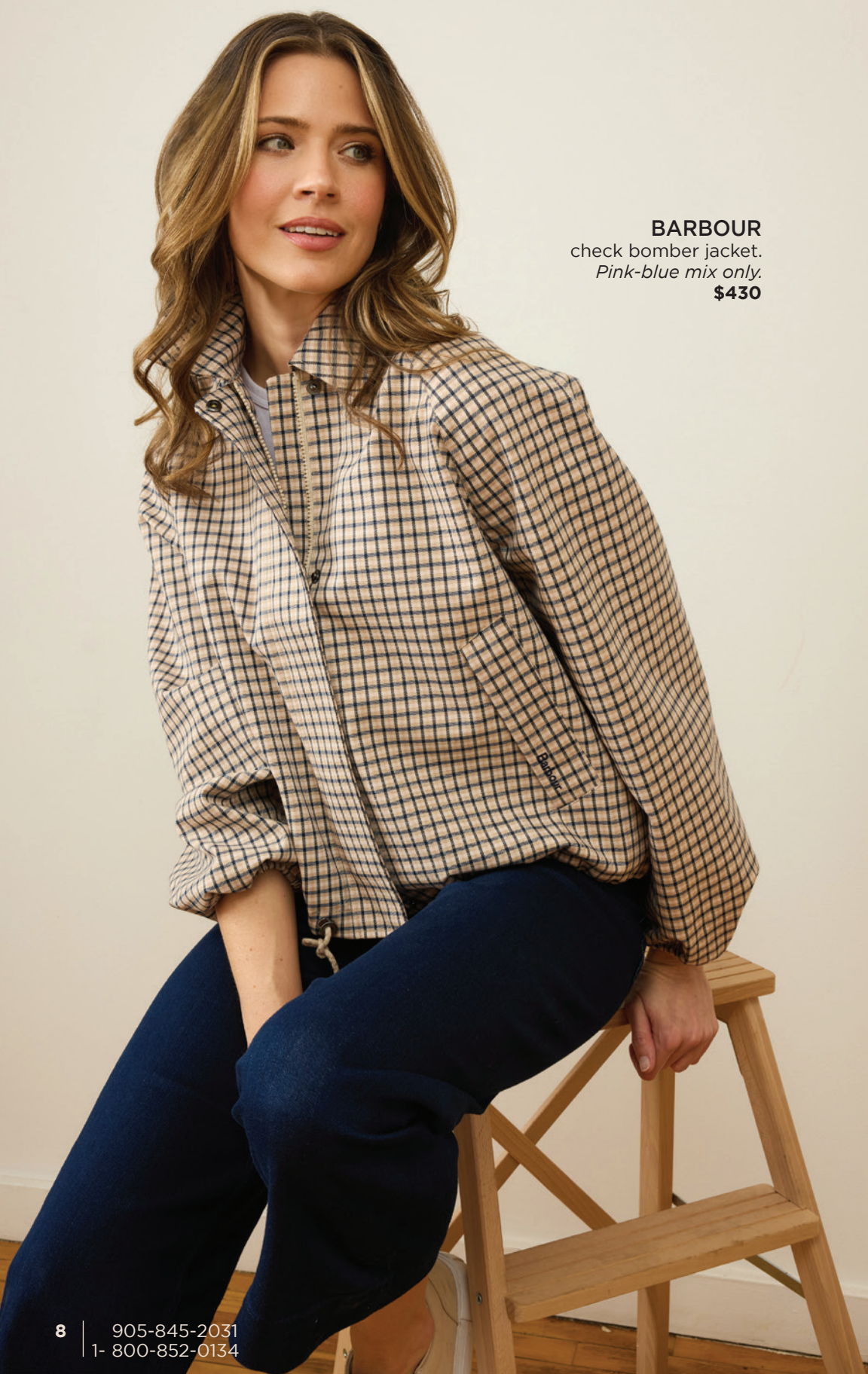
BARBOUR check bomber jacket. Pink-blue mix only. $430