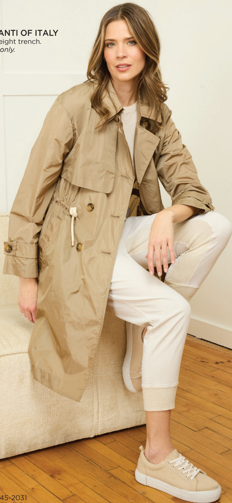
VIOLANTE OF ITALY lightweight trench. Taupe only. $445