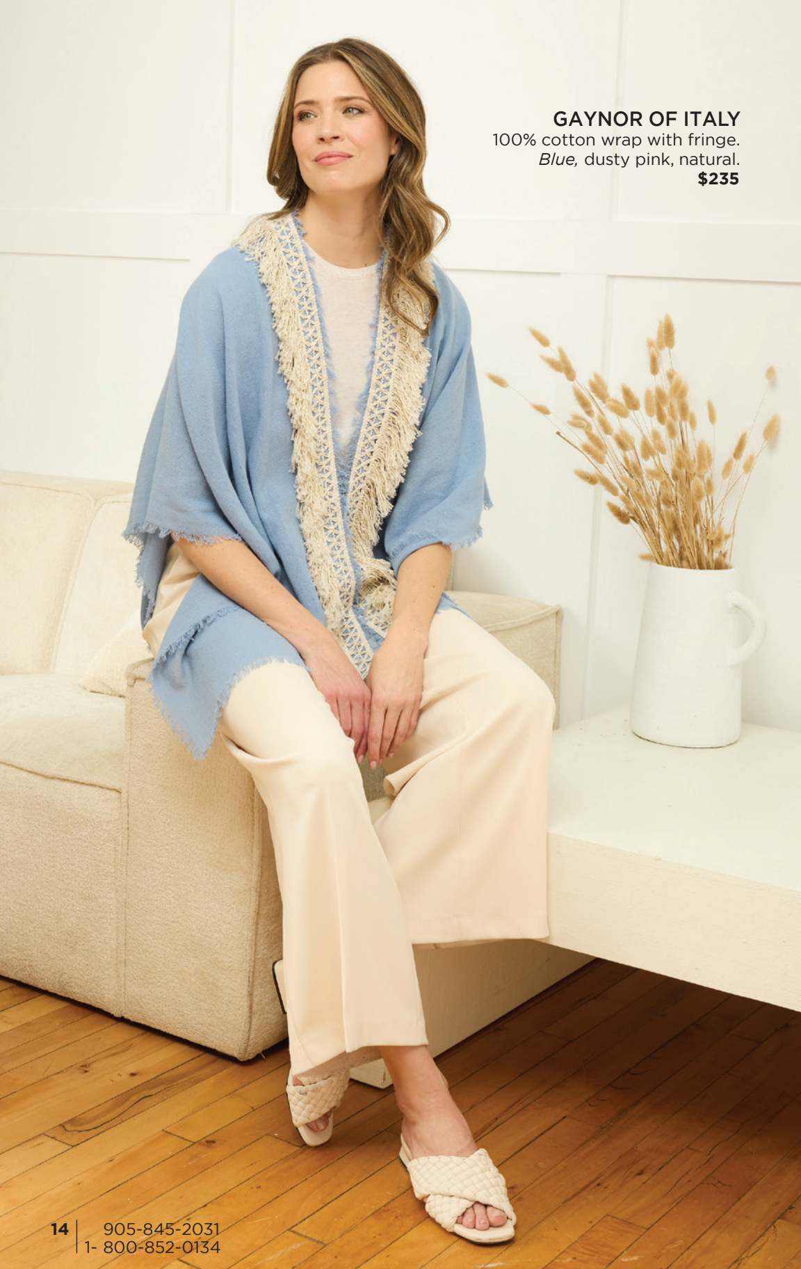
GAYNOR OF ITALY 100% cotton wrap with fringe. Blue, dusty pink, natural. $235