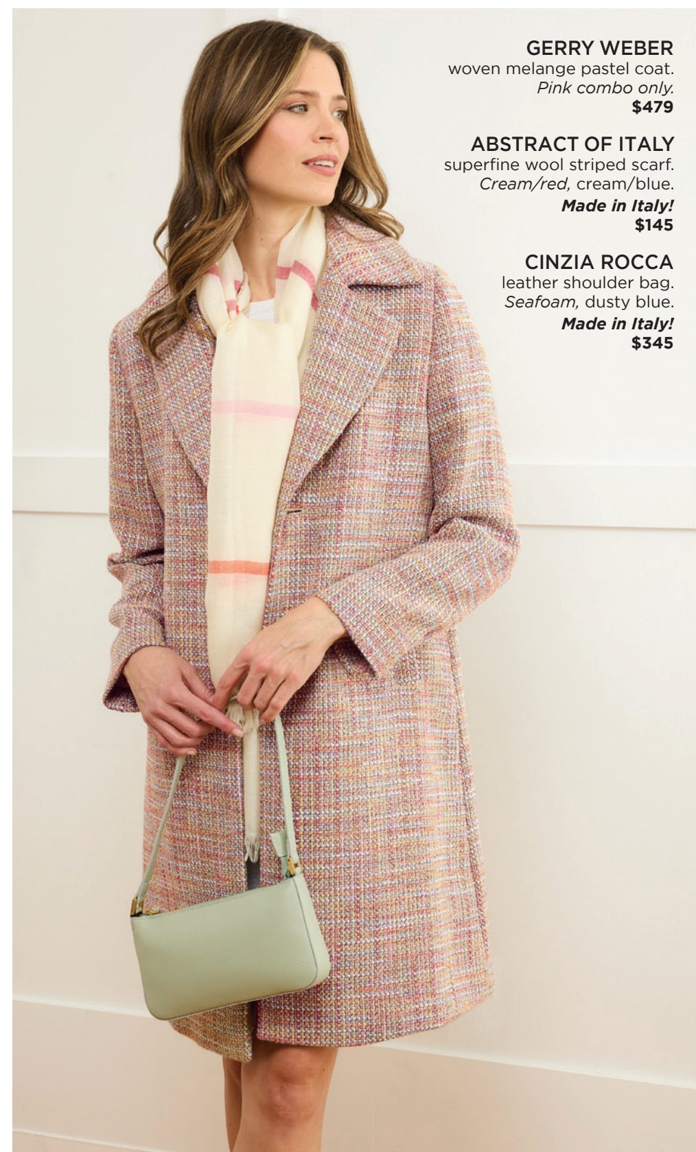
GERRY WEBER woven melange pastel coat. Pink combo only. $479