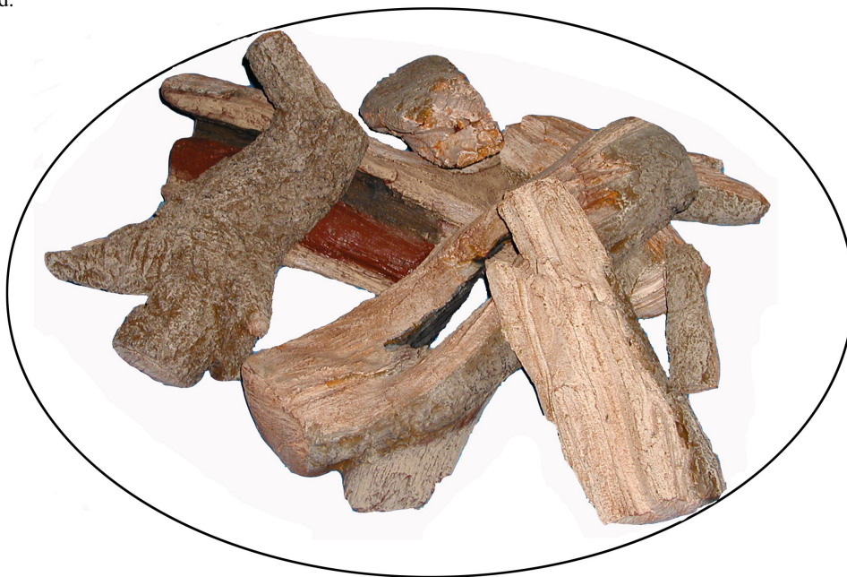
30" diameter log stack – Step 2