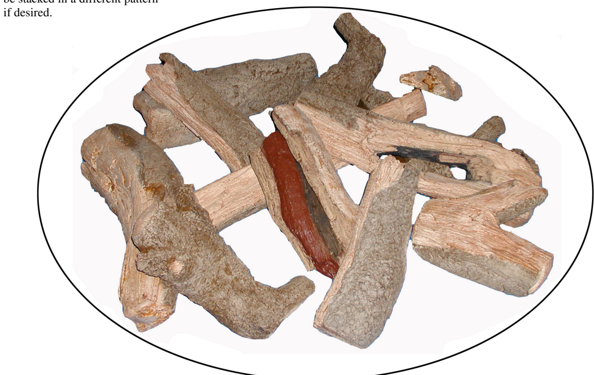
50" diameter log stack – Step 2

The arrangement shown is a suggested stack. The logs can be stacked in a different pattern