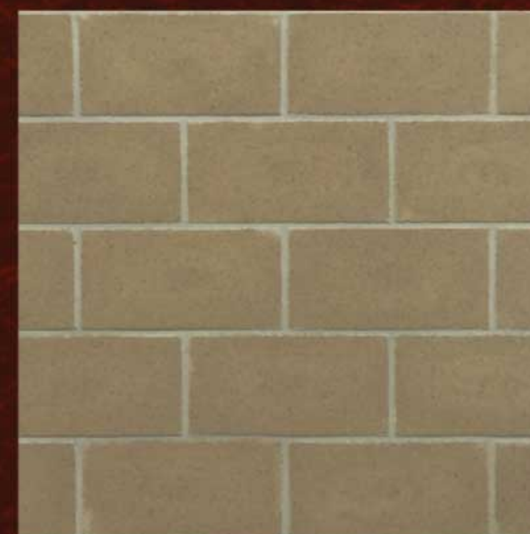
Full Running Bond