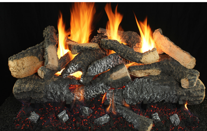
Kodiak Timbers Double Stack

Kodiak Timbers Double Stack is made from ceramic fiber and will glow with the heat of the flames. Our revolutionary fiber molding process retains all the detail of our refractory logs.