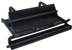
Double Stack Burner

Summit Burner - A deep, three-level pedestal grate with a combination pan and tube burner design. The largest burner available that is capable of burning in Natural Gas and Liquid Propane applications.