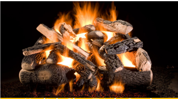
Kodiak Char Triple Stack

Kodiak Char Triple Stack features additional logs on our Triple-Stack burner system, which allows for an impressively large stack of logs.