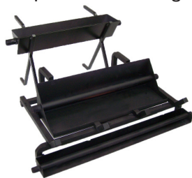
Triple Stack Burner