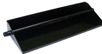
Ember Supreme Burner