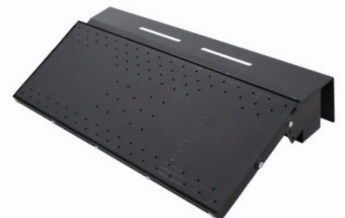
System 4 Burner

Available with Manual Safety Pilot, On/Off Remote, Variable Remote, Millivolt, and Electronic Ignition