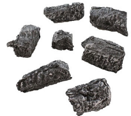
Fiber Char Chunk Kit