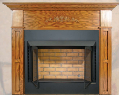
Shown with Flush Mount Mantel