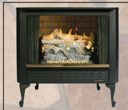
Shown As Freestanding Unit With Black Legs

The Model 384 is the perfect gas fireplace for installation in your home. This fireplace has a new Ember Stove Base design with a glowing ember bed. The firebox area is made complete by Oak Style ceramic logs, and Boston Buff brick panels for the most realistic look available. This fireplace has a 33,000 BTU rating and factory installed blower system with built in thermostat to ensure that only warm air is circulated throughout your home. The gas control system (L.P. or Natural Gas) is a Millivolt style valve which allows you to use an optional remote control or wireless wall thermostat for extra convenience and comfort.