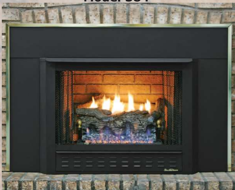
Shown As Fireplace Insert With Trim Kit