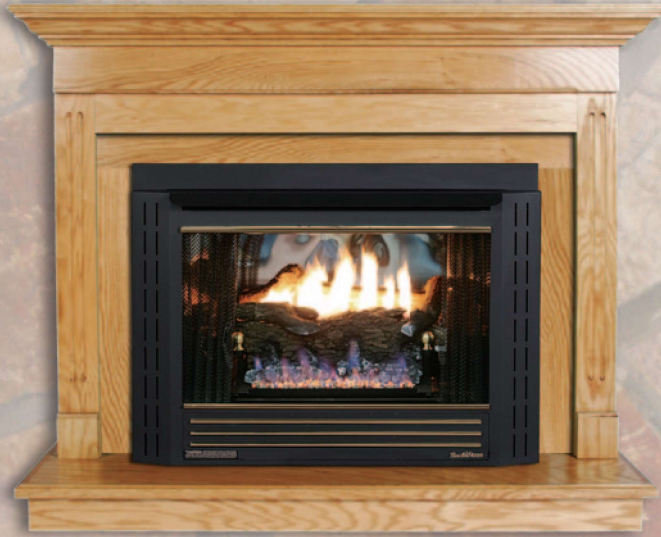
Shown With Brass Accents In Contemporary Mantel With Light Finish (Also Available In Dark Finish)

The Model 34 ZC is our most popular vent-free Fireplace providing up to 33,000 BTU's of clean heat. Standard features include factory installed variable speed blower and thermostatically controlled gas which modulates to maintain desired heat output. Optional Millivolt gas valve for use with remote control or wall thermostat. Choose from numerous installation options to fit every need. Model 34ZC can be used as a masonry fireplace insert, freestanding with optional mantel or this unit can be built into existing wall for zero clearance application.