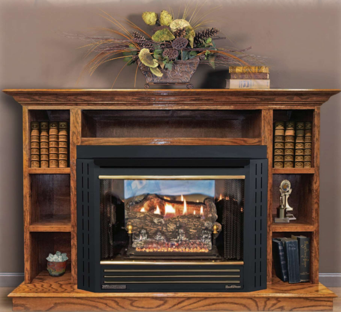
Model 34ZC in Prestige Bookcase Mantel