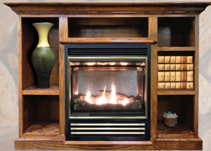
1127 shown above in optional Prestige bookcase mantel.

These units prove that good things come in small packages. For just pennies per hour you can enjoy up to 10,000 BTU's (Model 1110) or up to 25,000 BTU's (Model 1127) of heat circulating throughout your home by the factory installed variable speed blower system. The model 1110 is approved for bedroom use (check local codes) and is identical in size and shape to the model 1127. Both models share the same great options and both models are wall mountable.