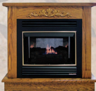
Shown In Optional Finished Mantel

Model BR10ZC Specifications* BTU/H: 10,000 Unit: 25 3/8" W x 23 3/4" H x 13" D Mantel: 37 1/2" W x 36" H x 15 1/2" D Other Specs & Dimensions Listed On Back Page Model BR10ZC is approved for bedroom use. Check your local building codes for guidelines.