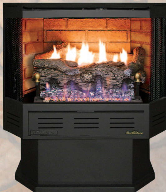
Shown As Freestanding With Pedestal

*Size, Color, Style and Options on units and mantels are subject to change without notice.