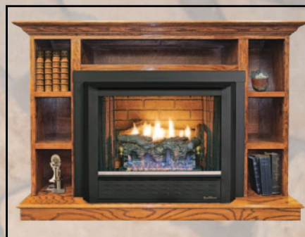
Shown In Prestige Mantel With Dark Finish