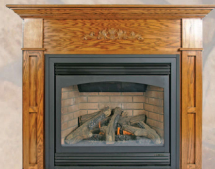
Shown In Optional Finished Flush Mantel

Model DV1000ZC Specifications* BTU/H: 25,000 Unit: 38 1/8" W x 33 1/2" H x 16 1/2" D Mantel: 58 3/8" W x 46 3/4" H x 6" D Other Specs & Dimensions Listed On Back Page Requires outside air for combustion, DV1000ZC approved for bedroom installation. Check local codes.