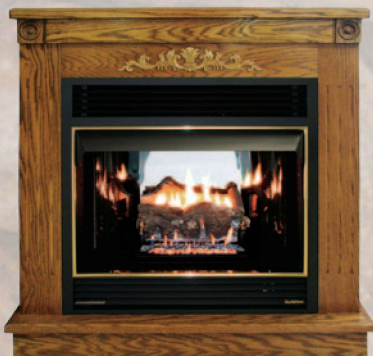
Shown In Optional Finished Mantel

Model 36ZC Specifications* BTU/H: 33,000 Unit: 37 1/8" W x 35 1/2" H x 18 3/4" D Mantel: 51 1/2" W x 51 3/4" H x 26 3/4" D Other Specs & Dimensions Listed On Back Page Model 36ZC and 42ZC (not pictured) are similar in style. Refer to back page for specifications.