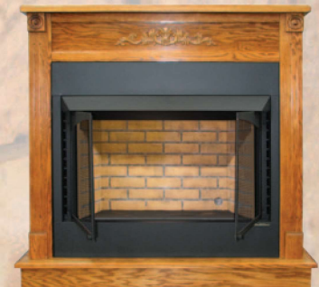
Shown with Deluxe Mantel

Our Model ZCBB is available as a 36" or 42" zero clearance universal firebox. Install it almost anywhere since no chimney or hearth is required. Customize for the look you want with tile, rock or marble and add a raised hearth if you desire. The ZCBB offers an efficient heat circulating design which keeps warm air flowing. This fireplace is perfectly completed by adding a set of Buck Stove Vent-Free Ember Vision Gas Logs.