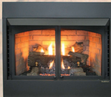
Shown with Optional Log Set (ZCBBXL)