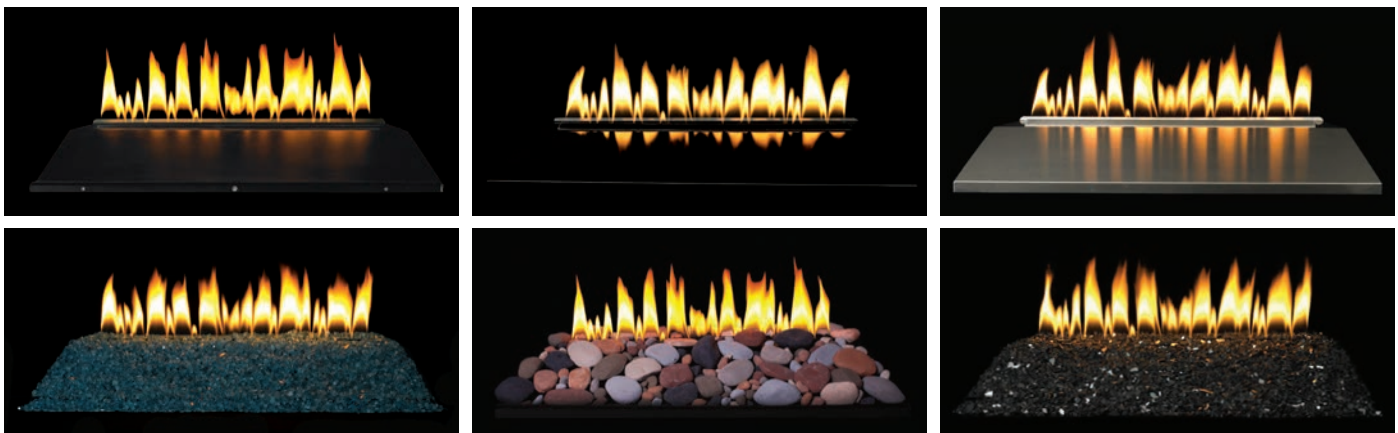
Top Row left to right: No Decorative Options, Polished Black Decorative Top, Brushed Stainless Steel Decorative Top. Bottom Row left to right: Blue Clear Decorative Glass, Medium Decorative Rocks and Accent Pebbles, Polished Black Decorative Glass. (Clear Frost Decorative Glass shown on opposite page)