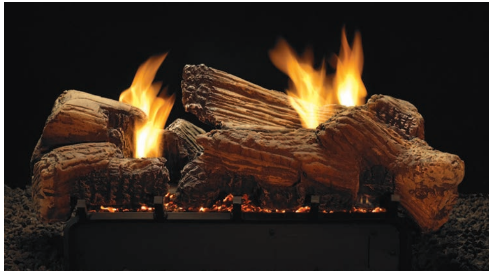
The Stone River Ceramic Fiber Log Set (LSU-24SF) provides a different look from every angle. The Vent-Free Slope Glaze Vista Burner (VFSUR-24) neatly conceals its controls behind a sliding panel.