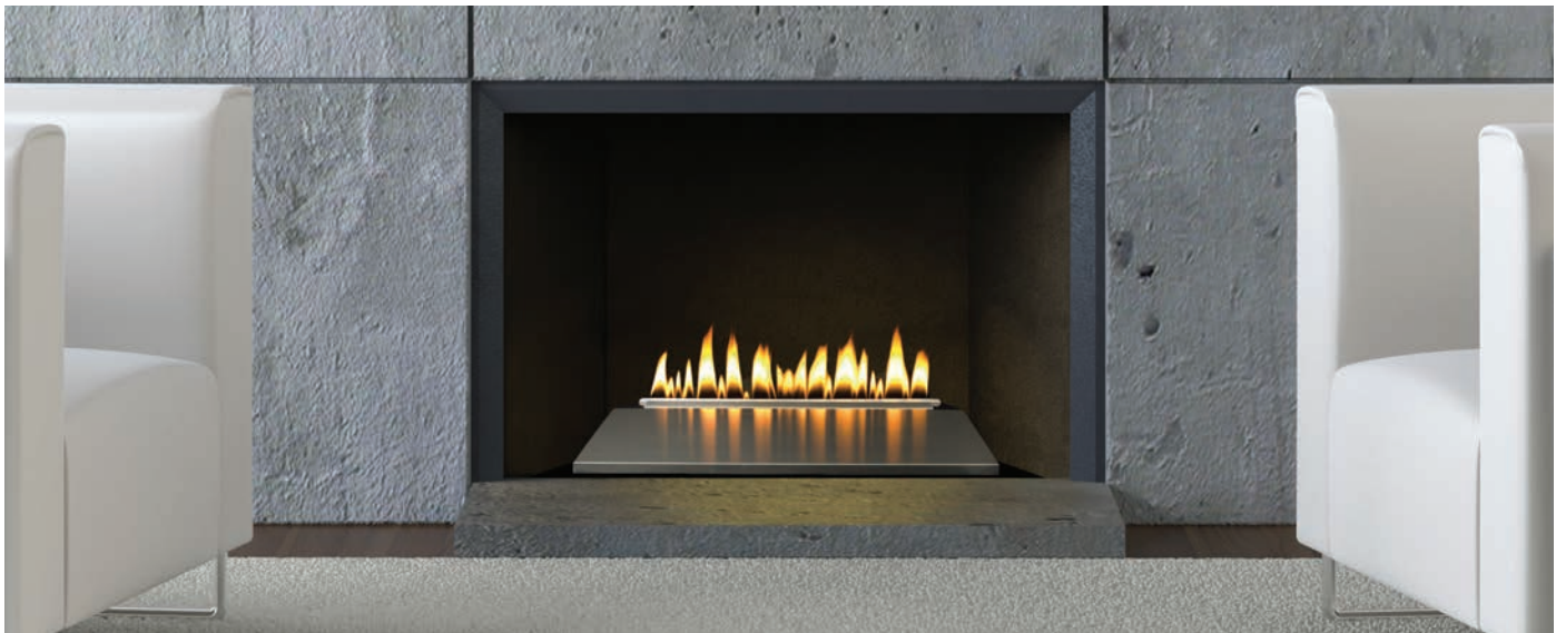
Loft Series Vent-Free Burner (VFRL-24) with Stainless Steel Decorative Top (DT-24-SS). Shown in existing masonry firebox.

A vent-free Millivolt Loft Burner may also be installed as a decorative appliance in a vented fireplace to provide ambiance and light – but without the heat. In a vented installation, the burner cannot be operated by thermostat, and the flue damper must be blocked open. A damper clamp is included with all Loft burners. Because IP Loft Burners include a thermostat remote and may not be installed as decorative appliances, a non-thermostat remote is available.