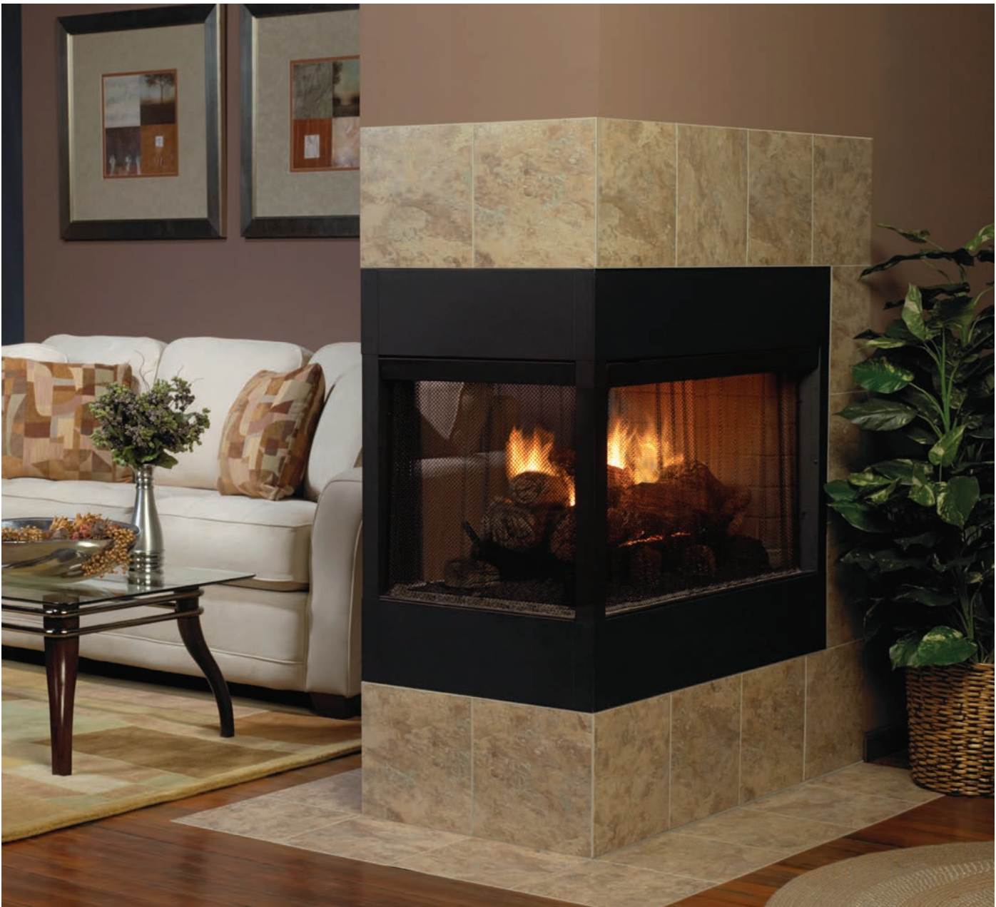
White Mountain Hearth Stone River Log Set (LSU-24SF) on a Vent-Free Slope Glaze Vista Burner. Shown in a peninsula firebox with custom tile surround. The optional Large Log Embers Kit (EK-2) and Platinum Glowing Embers (PE20) add that extra spark of realism.