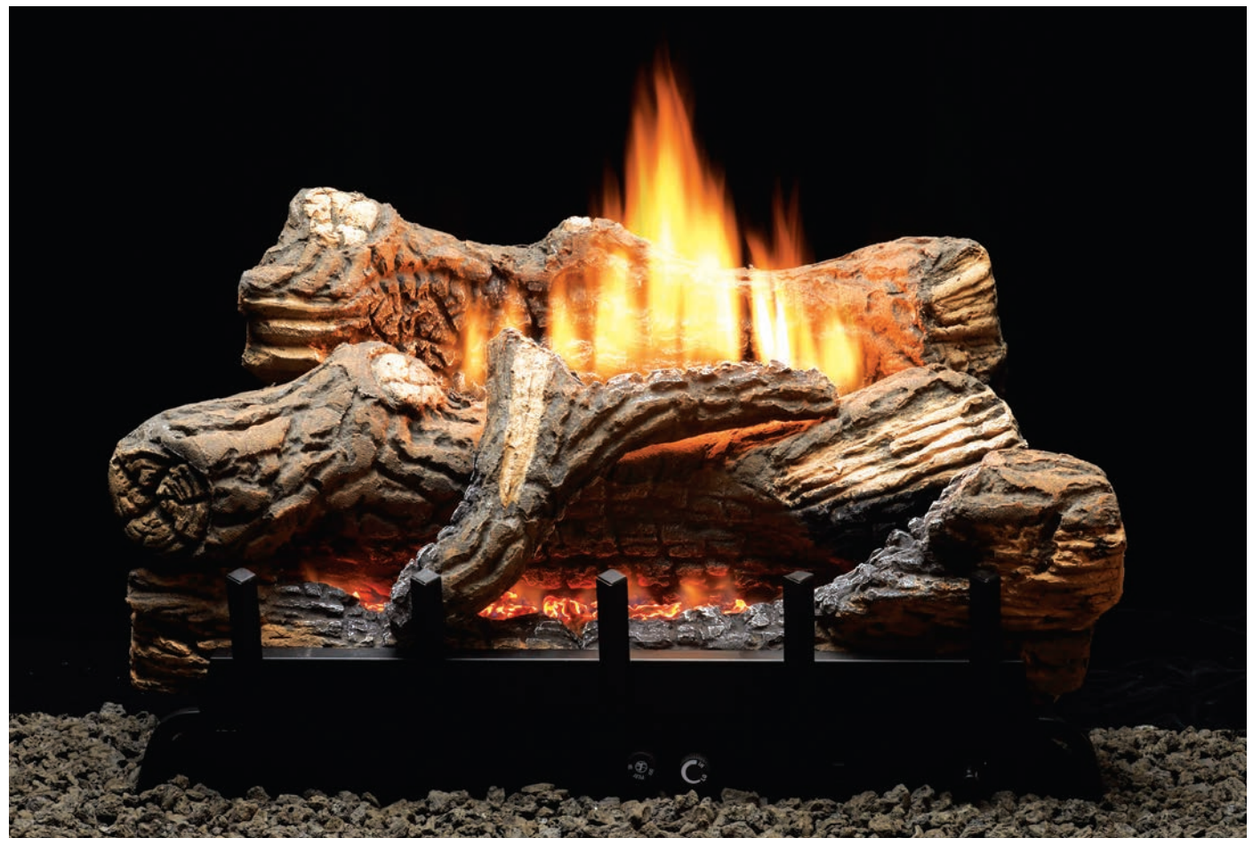
Trenton Ceramic Fiber Log Set and Vent-Free Burner Combination (VFDR-24LB)

The Trenton Log Set features richly detailed, hand-painted Ceramic Fiber logs mounted atop our Vent-Free Contour Burner. This complete set includes glowing embers to add to the illusion of a real wood fire at any heat setting. This competitively priced set is ideal for existing fireplaces and fireboxes and for new construction. Available in manual control, thermostat control, or remote-ready Millivolt – in 28,000 Btu, 34,000 Btu and 40,000 Btu.