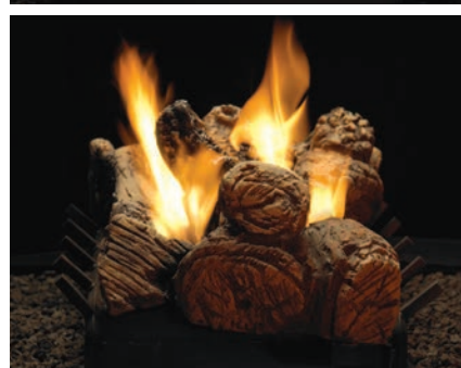
Opposite Side View (above) and End View (below)