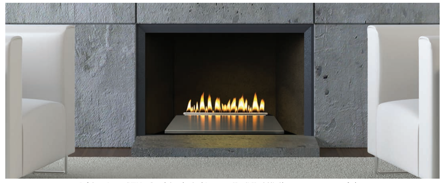
{\it Loft Series Burner (VFRL-24) with Stainless Steel Decorative Top~(DT-24-SS)}.~Shown~in~existing~masonry~firebox.

A vent-free Millivolt Loft Burner may also be installed as a decorative appliance in a vented fireplace to provide ambiance and light – but without the heat. In a vented installation, the burner cannot be operated by thermostat and the flue damper must be blocked open. A damper clamp is included with each Millivolt Loft burner. Because IP Loft Burners include a thermostat and may not be installed as decorative appliances, a non-thermostat remote is available.