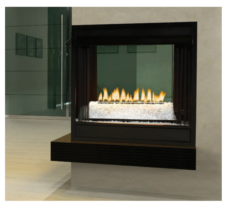
Loft Series Vent-Free Multi-sided burner (VFRU-24) with Clear Frost Decorative Glass (DG-30-CLF). Shown in a Vent-Free peninsula firebox with Flush Louvers.