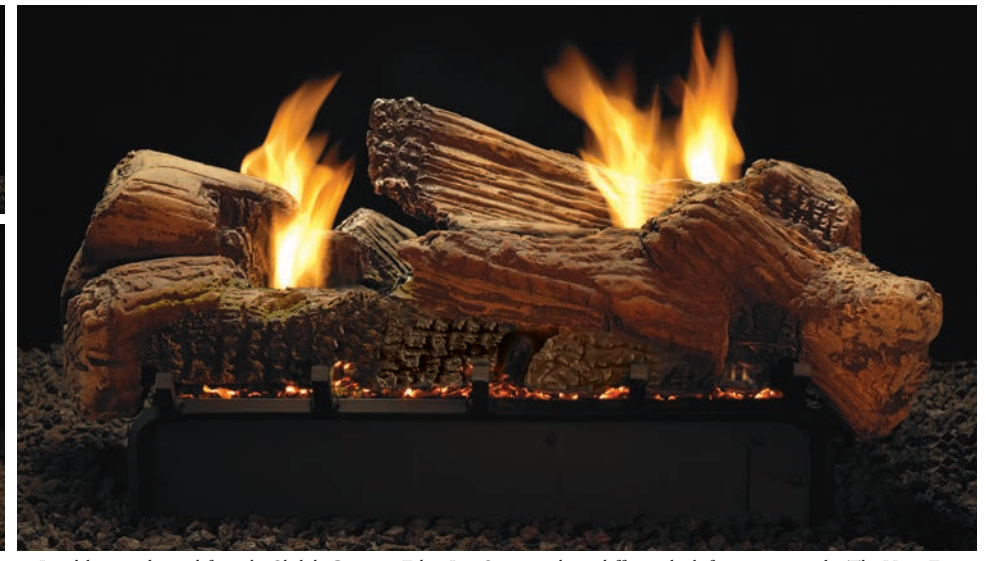
Just like a real wood fire, the Shiloh Ceramic Fiber Log Set provides a different look from every angle. The Vent-Free Slope Glaze Vista Burner neatly conceals its controls behind a sliding panel.