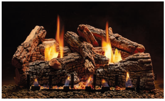
Ravenwood Select Refractory Log Set (ALS-24RVS) with Vent-Free Slope Glaze Burner System (VFSE-24)