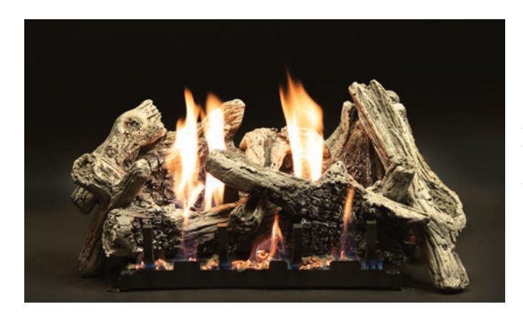
Driftwood Burncrete* Log Set (LS-18CD) with Vent-Free Slope Glaze Burner System (VFSR-18)