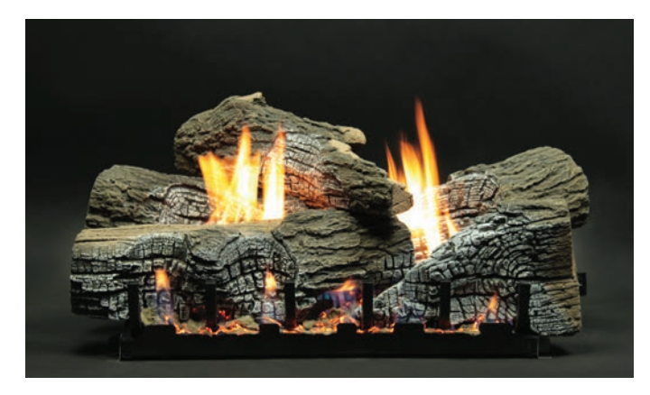
Stacked Wildwood Refractory Log Set (LS24WRR) with Vent-Free Slope Glaze Burner System (VFSR-24)