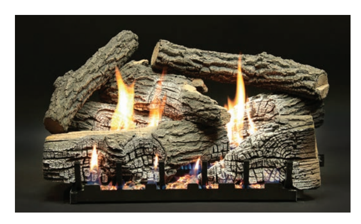
Super Stacked Wildwood Refractory Log Set (LS24WRS) with Vent-Free Slope Glaze Burner System (VFSR-24)