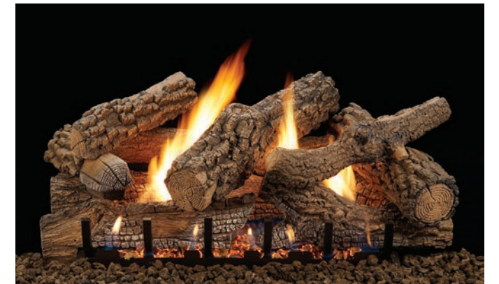
Saratoga Refractory Log Set (ALS-24SG) with Vent-Free Slope Glaze Burner System (VFSR-24)