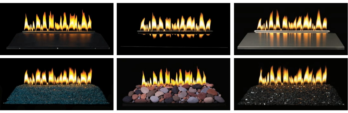
Top Row left to right: No Decorative Options, Polished Black Decorative Top, Brushed Stainless Steel Decorative Top. Bottom Row left to right: Blue Clear Decorative Glass, Medium Decorative Rocks and Accent Pebbles, Polished Black Decorative Glass. (Clear Frost Decorative Glass shown on opposite page)