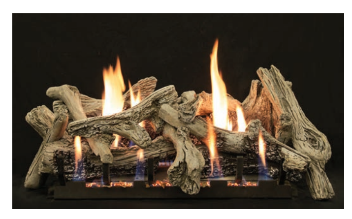
Driftwood Burncrete* Log Set (LS-24CD) with Vent-Free Slope Glaze Burner System (VFSR-24)