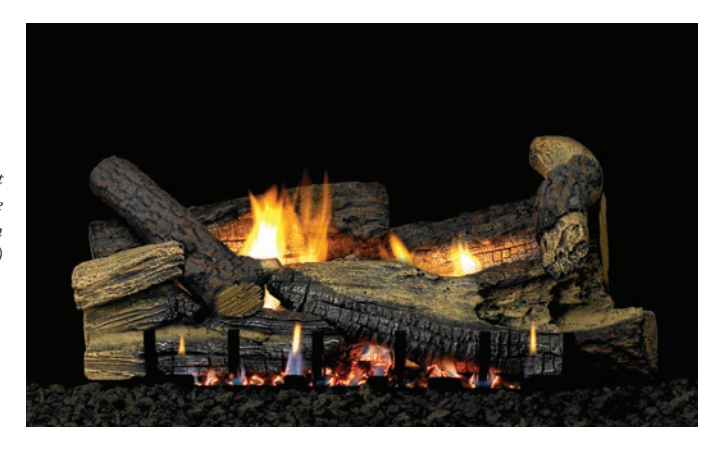
Refractory Yorktown Log Set (ALS-24YK) with Vent-Free Slope Glaze Burner System (VFSE-24)