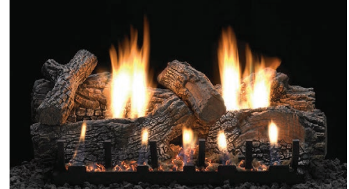
Charleston Refractory Log Set (ALS-24CRI) with Vent-Free Slope Glaze Burner System (VFSR-24)