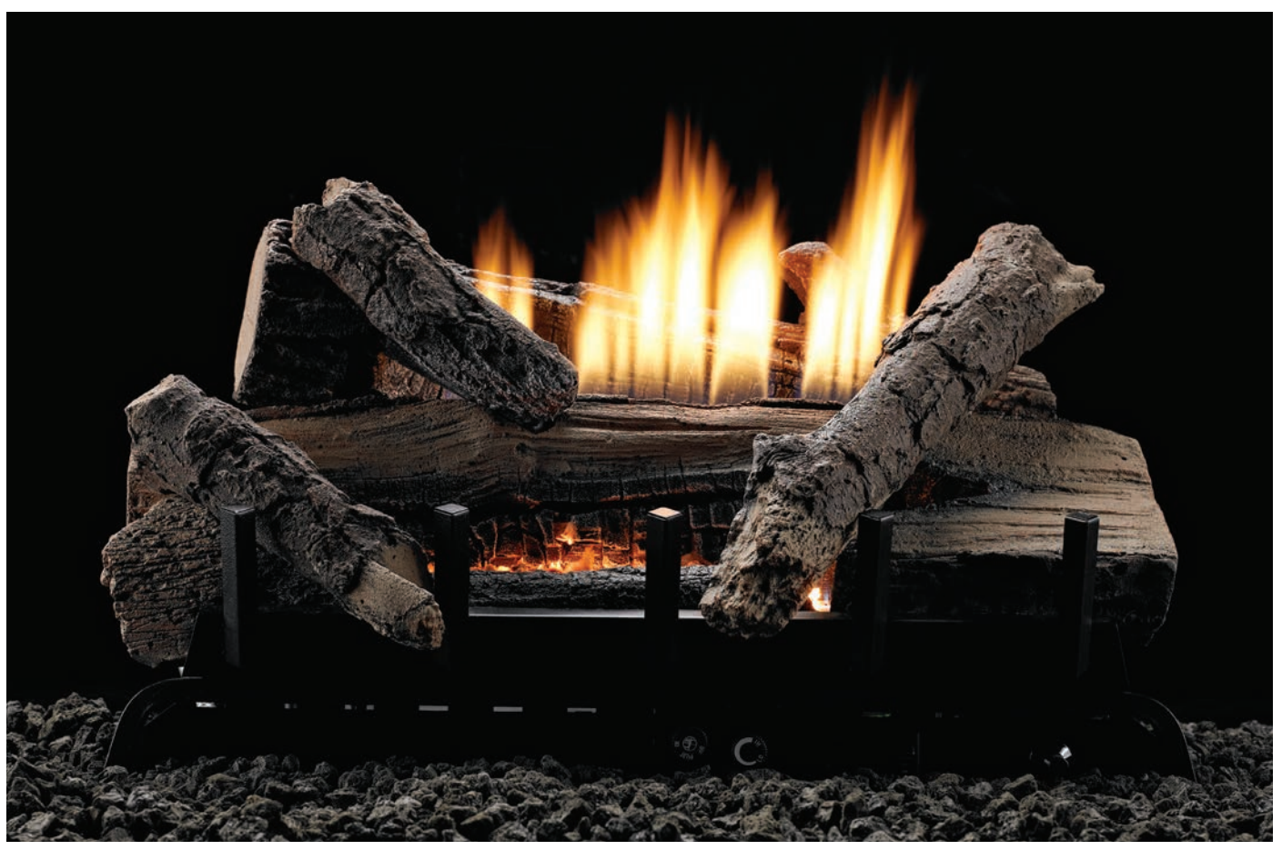
Concord Refractory Log Set and Vent-Free Burner combination (VFDR-18-LBW)

The Trenton and Concord are also offered in 10,000 Btu models for bedroom applications, where allowed by code.