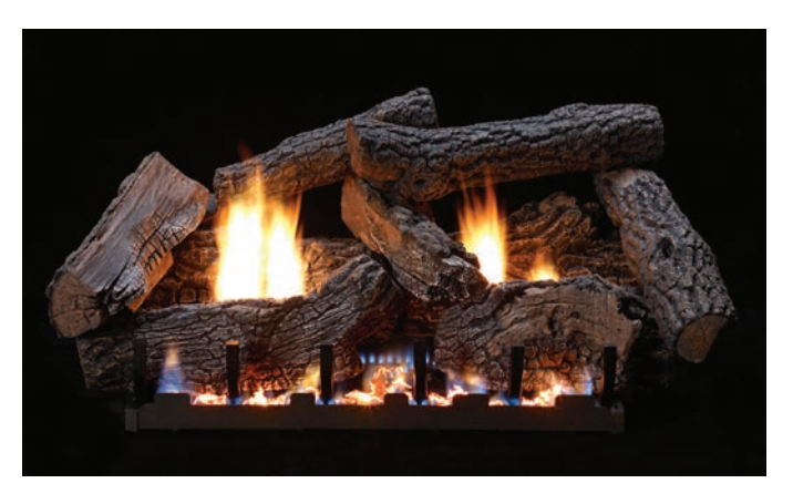
Charleston Select Refractory Log Set (ALS-24CR1S) with Vent-Free Slope Glaze Burner System (VFSR-24)