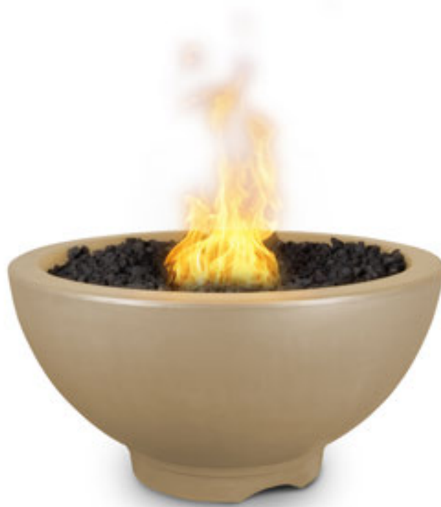
BROWN FINISH SHOWN