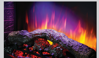
TOP LIGHT ACCENTUATES MEDIA