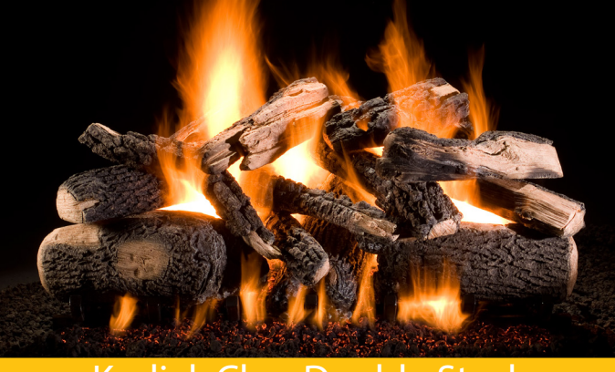
Kodiak Char Double Stack

Hargrove's Large Sets feature many styles of massive logs for large fireplace applications. Designed in combination with our Double-Stack and Triple-Stack burner systems, and were 2008 Vesta Award Finalists.