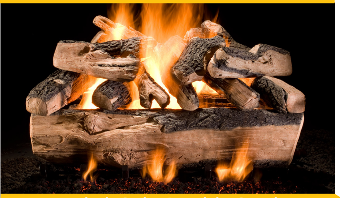
Kodiak Split Double Stack

Kodiak Split Double Stack offers exceptionally large and detailed split logs with deep textured bark for an outstanding fresh cut look.