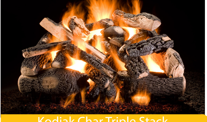
Kodiak Char Triple Stack

Kodiak Triple Stack features additional logs on our Triple-Stack burner system, which allows for an impressively large stack of logs.