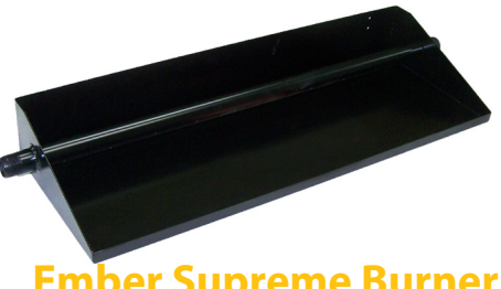
Ember Supreme Burner