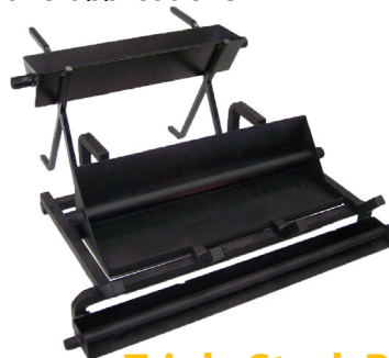
Triple Stack Burner