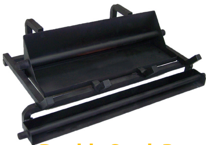
Double Stack Burner