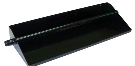
Ember Supreme Burner