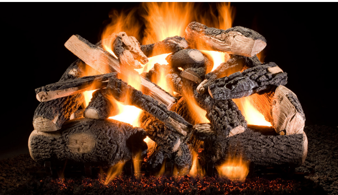
Kodiak Char Triple Stack

Kodiak Triple Stack features additional logs on our Triple-Stack burner system, which allows for an impressively large stack of logs.