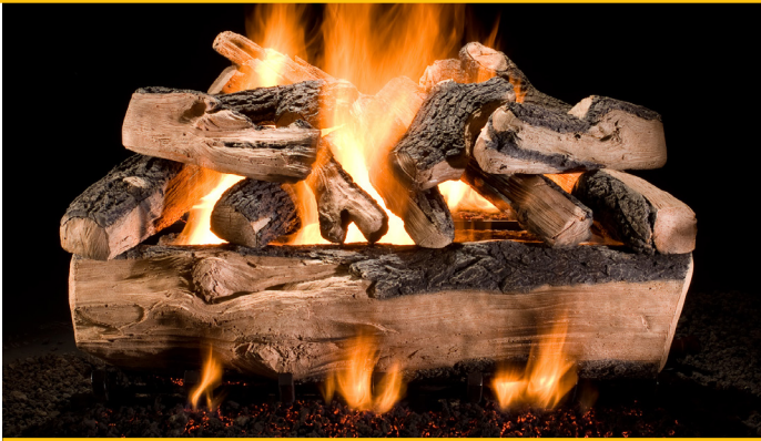
Kodiak Split Double Stack

Kodiak Split Double Stack offers exceptionally large and detailed split logs with deep textured bark for an outstanding fresh cut look.