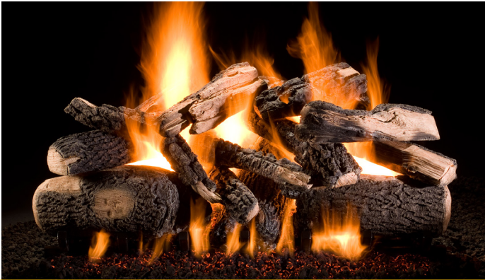
Kodiak Char Double Stack

Hargrove's Large Sets feature many styles of massive logs for large fireplace applications. Designed in combination with our Double-Stack and Triple-Stack burner systems, and were 2008 Vesta Award Finalists.