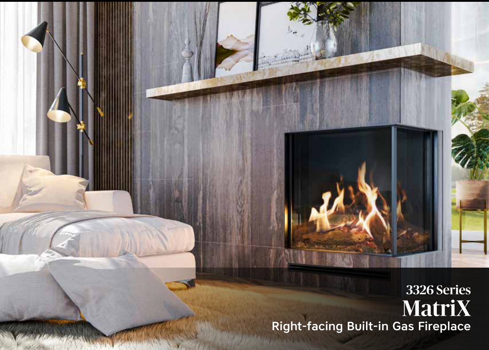
3326 Series Matrix Right-facing Built-in Gas Fireplace

Faber helps you create the atmosphere and look you desire for your unique space. Our built-in Matrix models let you design your fireplace - to viewing angles and finishes.