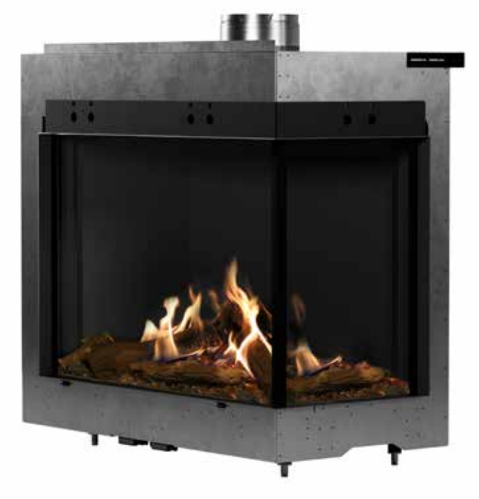
Also Available Electric e-MatriX