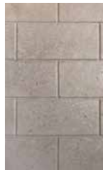
White Stacked Refractory Liners