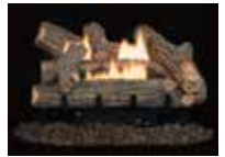
Crescent Hill HD