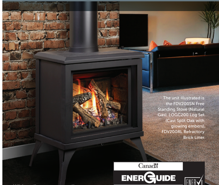
The unit illustrated is the FDV200SN Free Standing Stove (Natural Gas), LOGC200 Log Set (Cast Split Oak with glowing embers), FDV200RL Refractory Brick Liner.