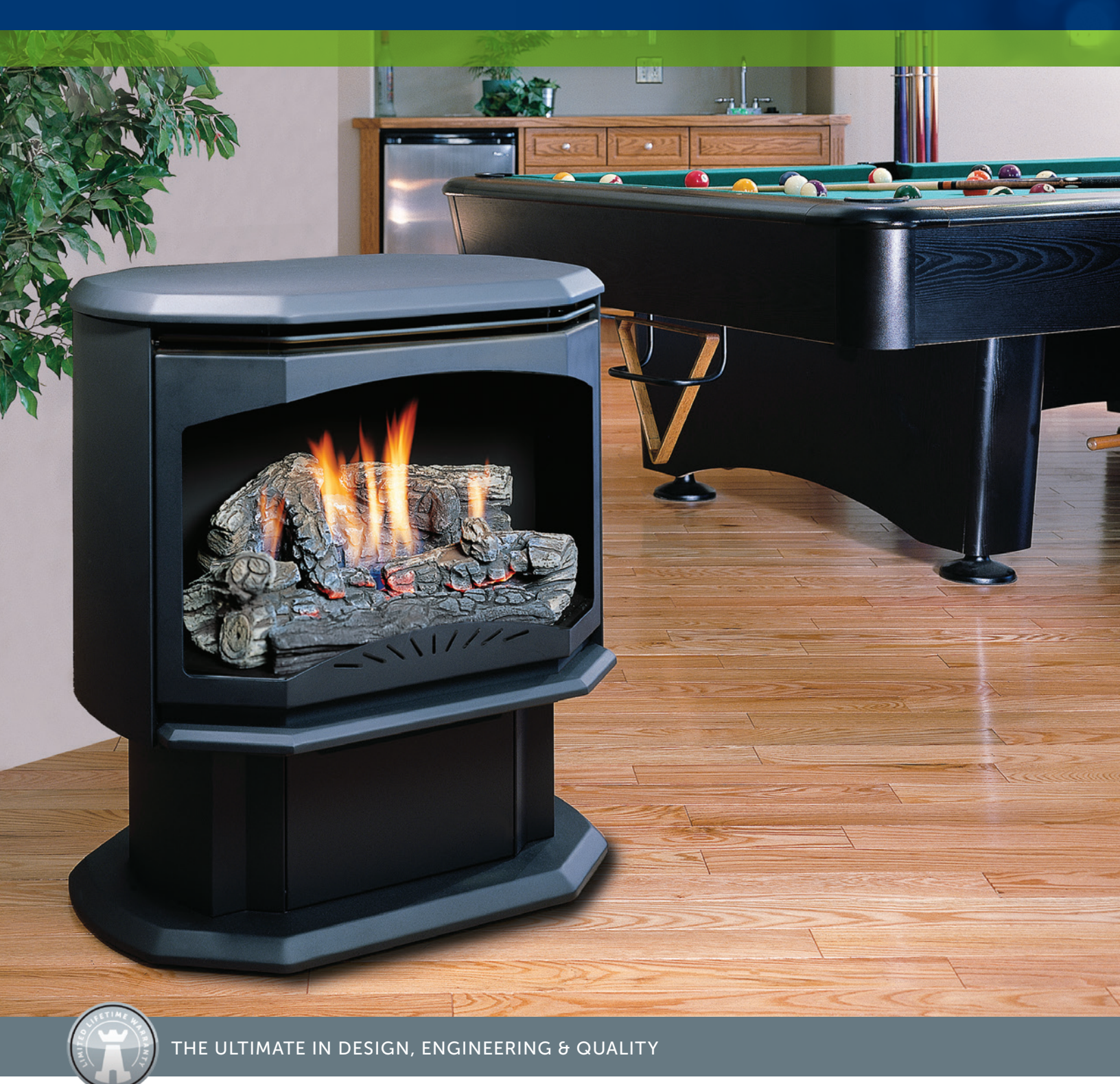
FVF350 VENT FREE FREE STANDING GAS STOVE

Vent Free appliances can only be installed in some areas of the United States.