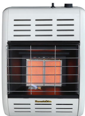
HRW060, HRW10 (shown)