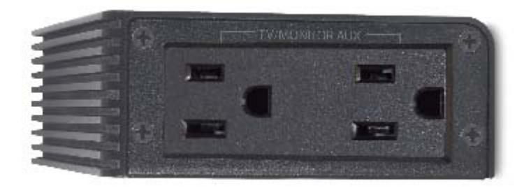
Figure 3. C2/C2-CN Outlet Panel

This section describes outlet panel functionality. The outlet panel for the C2/C2-CN Power Filter is shown in Figure 3. Outlet panel descriptions are provided immediately below Figure 3.