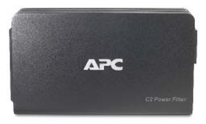
Figure 1. C2/C2-CN Wall Mount Power Filter -Front View

Isolated noise filter bank (INFB) technology eliminates electromagnetic interference and radio frequency interference (EMI/RFI) as sources of audio and video signal degradation, and data line surge protection jacks stop surges from traveling over phone lines.