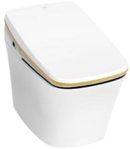
TCB 9100G / 9100GA (Auto Open/Close)