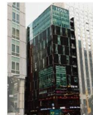
VOVO Seoul Office(HQ)