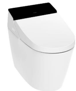
TCB 8200S / 8200SA (Auto Open/Close)