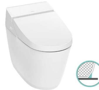
8400SA (Auto Open/Close)