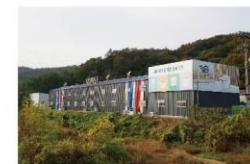
Manufacturing Facility and R&D Center