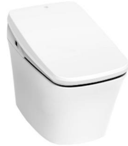
TCB 9100W / 9100WA (Auto Open/Close)