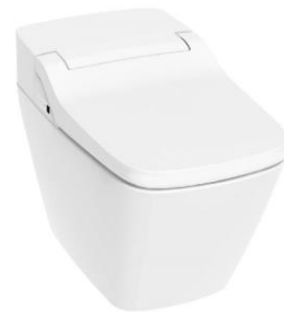
RC 090W (Digital Toilet)