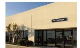
VOVO USA Branch Office