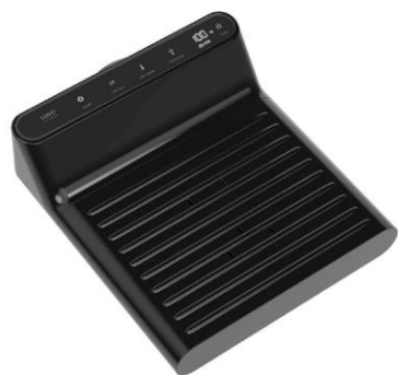
BD - 7700B (Matt Black)