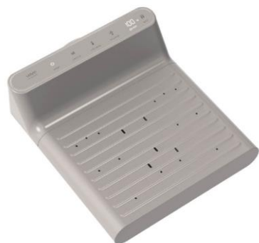
BD - 7700G (Matt Coffee Brown)