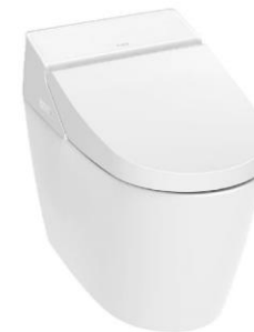
TCB 8200S / 8200SA (Auto Open/Close)