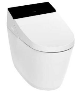
8400SA / B (Auto Open/Close)