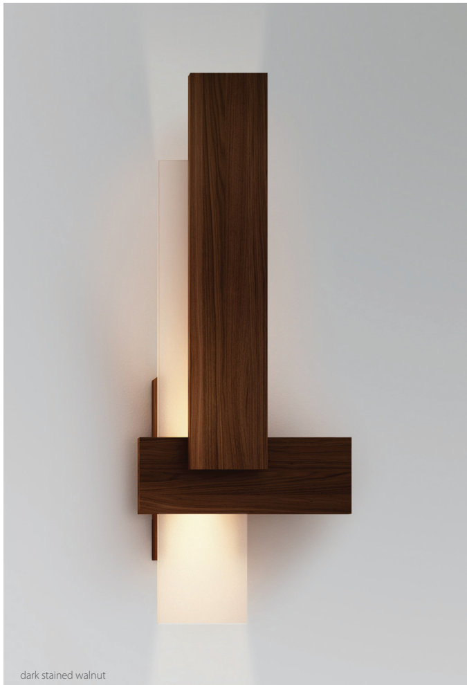
dark stained walnut

The Sedo is composed of just three floating planes all kept parallel to the wall. This simple composition cloaks the light engine from view and filters the light as it is delivered far up and down the wall. It's this wall grazing and diffuser glow that gives the Sedo a strong architectural presence.