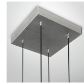
8" square canopy with black mesh cables