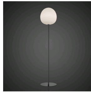
Rituals XL Mix&Match