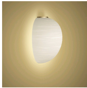
Rituals XL Mix&Match