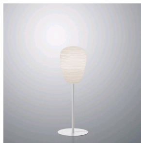
Rituals 1 Mix&Match