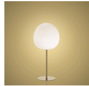
Rituals XL Mix&Match