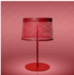
Twiggy Grid XL