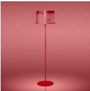
Twiggy Grid Lettura