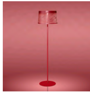
Twigggy Grid Lettura