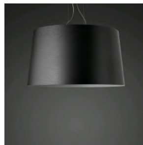
Twice as Twigggy