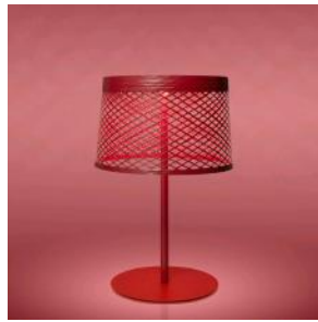
Twigggy Grid XL