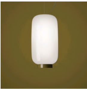
Chouchin Reverse 2