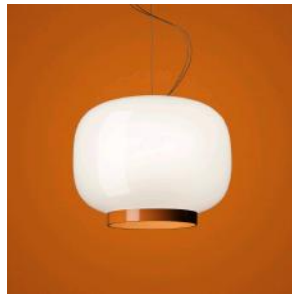
Chouchin Reverse 1