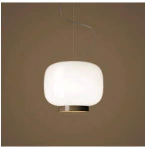
Chouchin Reverse 3