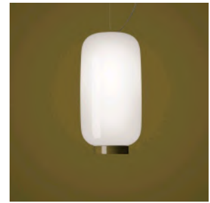
Chouchin Reverse 2