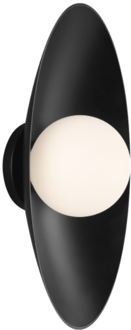
Matte Black/Matte Black Side View