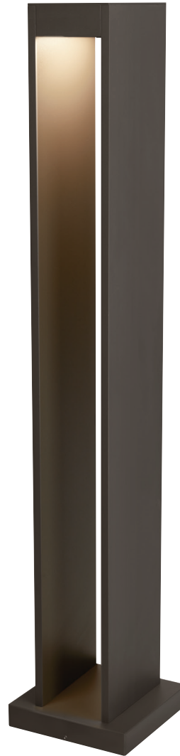
SYNTRA BOLLARD shown in bronze