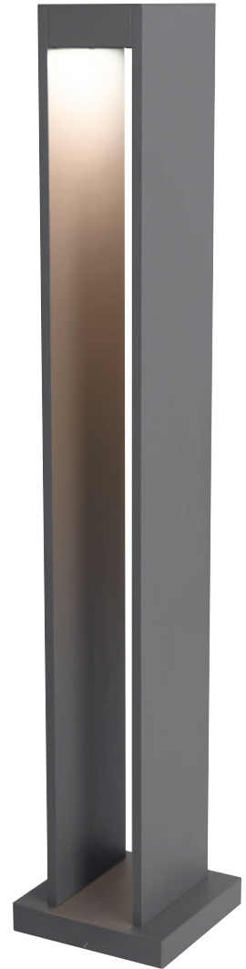
SYNTRA BOLLARD shown in charcoal