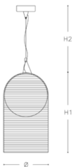
Technical drawing, dimensions and light sources refer to the main photo