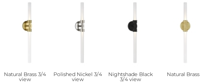
Natural Brass 3/4 view Polished Nickel 3/4 view Nightshade Black 3/4 view Natural Brass view

To view all available finish options, please visit techlighting.com