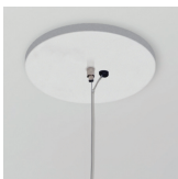
Calx 19 E26 low-profile round canopy with white SPT cord with steel cable