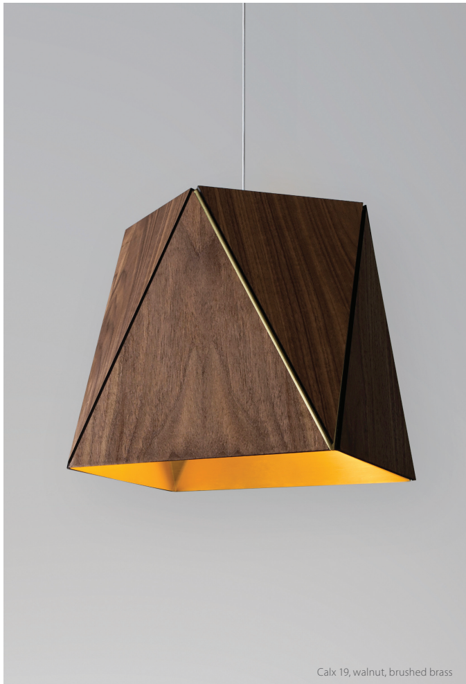
Calx 19, walnut, brushed brass