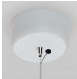
Calx 19 Integrated LED extended-profile round canopy braided cord with steel cable