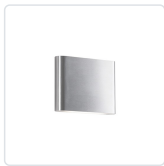
AT6506-BN Brushed Nickel