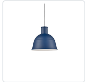
493516-IB Indigo Blue

Single-lamp pendant with aluminum dome shade showcasing powder-coated finishes. Exterior shade colors are black, white or blue, with matte white interior. Suspended by cloth cable to a maximum 120" length. Available in three sizes.