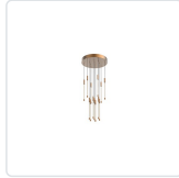
MP75113-BG Brushed Gold